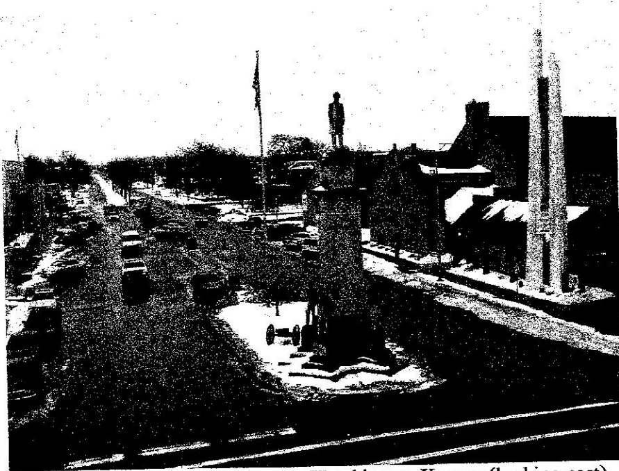
Soldiers and Sailors Monument, Hutchinson, Kansas (looking east)