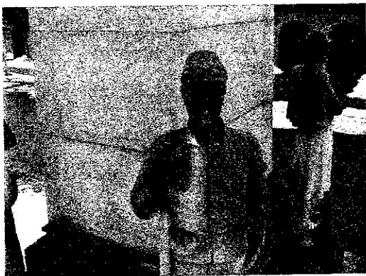
NW statue - Artillerist - missing right hand