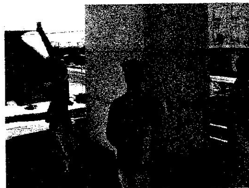
NE statue Sailor - complete