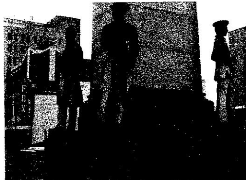
SE statue - cavalryman - missing end of scabbard and back knob on boot spurs