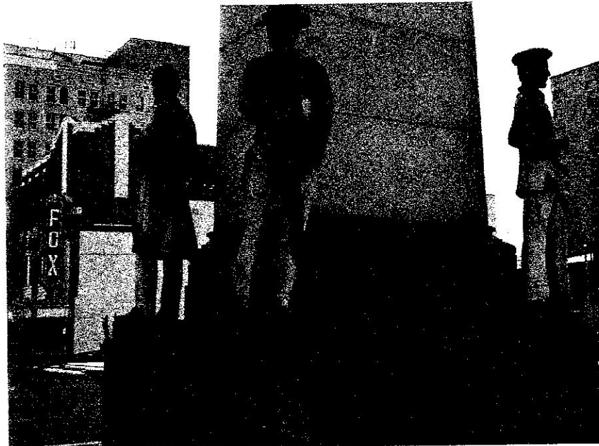
Base Statues (from left - Infantryman, Cavalryman, Sailor)