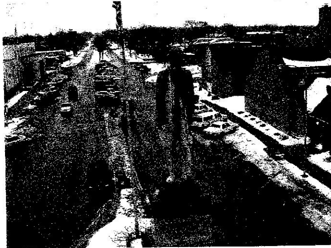
Abraham Lincoln (on top of monument)