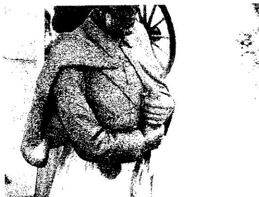
SW statue - Infantryman - missing top end of rifle barrel, rifle mechanics, lock and hammer