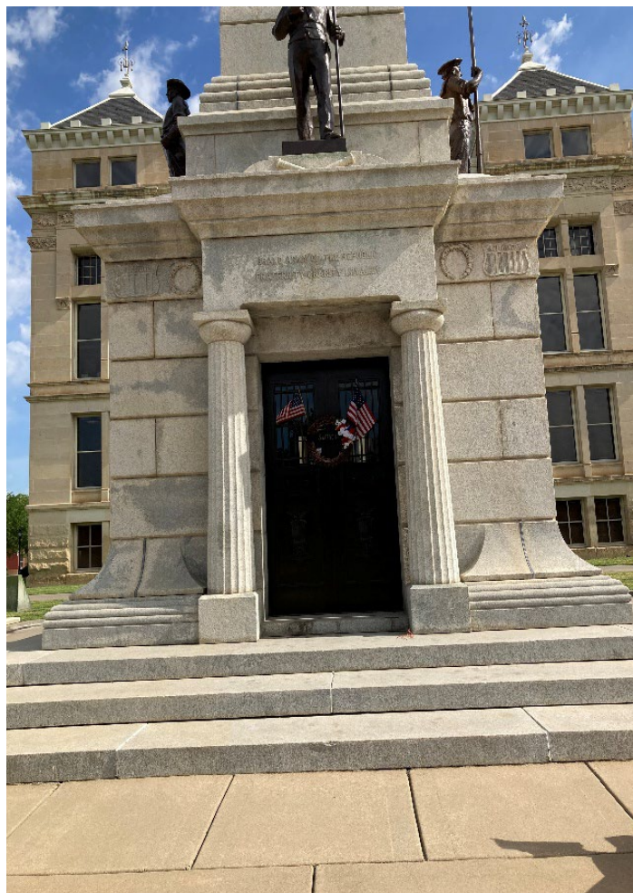
Grand Army of the Republic Monument at Wichita Courthouse.

The May workday on the seventeenth was focused on the GAR areas at the cemeteries and included trimming and edging of those areas for Memorial Day ceremonies. The local DUVCW chapter coordinates these ceremonies with the camp.