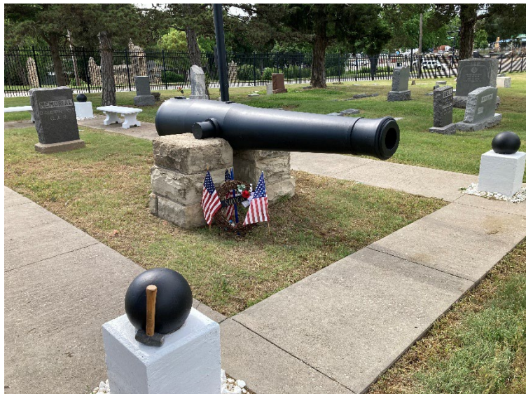
Grand Army of the Republic Section at Highland Cemetery, Wichita