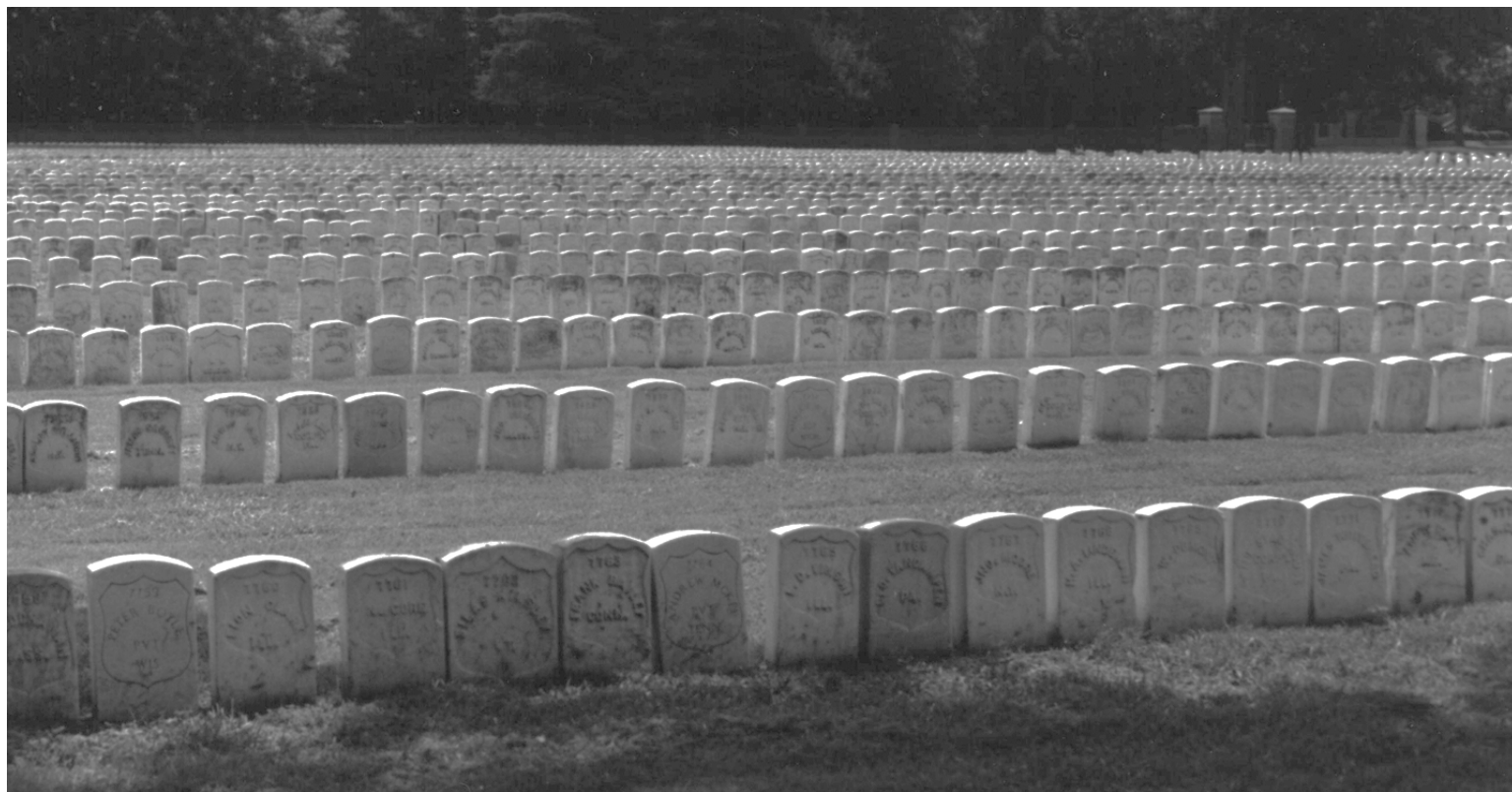
The graves of Union Civil War soldiers who died while confined in the prison at Andersonville, Georgia. This photograph is of Section H in Andersonville National Cemetery.

Our Federal Charter reminds us our purposes as Sons of Union Veterans of the Civil War is to perpetuate the memory of the Grand Army of the Republic and of the men who saved the Union in 1861 to 1865; to assist in every practicable way in preserving, and making available for research, documents and records pertaining to the Grand Army of the Republic and its members; to cooperate in honoring all those who have served our country patriotically in any war; to teach patriotism, the duties of citizenship, the true history of our country, and the love and honor of our flag; to oppose every tendency or movement that would weaken loyalty to, destroy, or impair our constitutional Union; and inculcate and broadly sustain the American principles of representative government, equal rights, and impartial justice for all.